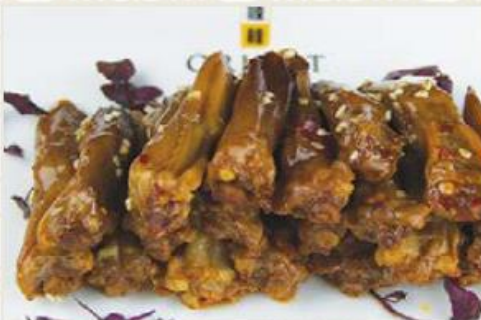
麻辣鴨舌 Marinated spicy duck tongues