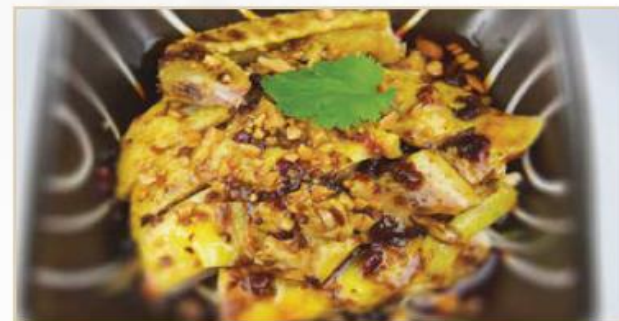
口水雞 'Hau shui' chicken (with bone) (served in chilli oil) ② ④