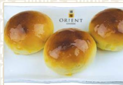
叉燒餐飽仔 Baked mini roast pork buns