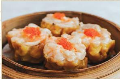
蟹皇蒸燒賣 Pork & Prawn dumplings topped with crab roe (siu mai)