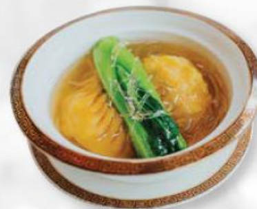
上湯海皇餃 Seafood dumpling in supreme stock (pork soup based)