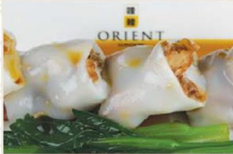
叉燒腸粉 Roast pork cheung fun