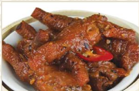
豉椒蒸鳳爪 Chicken claws in black bean sauce 🌶️ 🥜