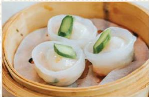
翡翠帶子餃 Scallop dumplings