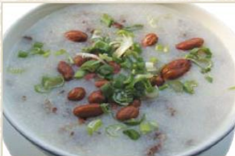
牛肉艇仔粥 Beef & seafood congee