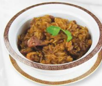
臘味糯米飯 Glutinous rice with savoury meats & dried shrimp

圖片只作參考 Images are for reference only • 🌶️ Hot & Spicy • 🥜 Contain Nuts • 🌱 Suitable for vegetarian • * Denotes option