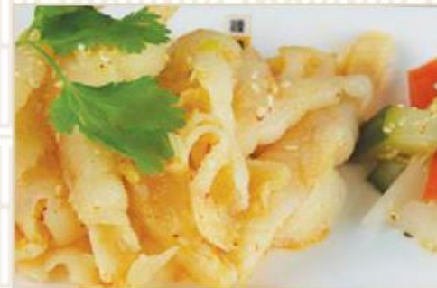
泰式去骨鳳爪 Thai style chicken claws