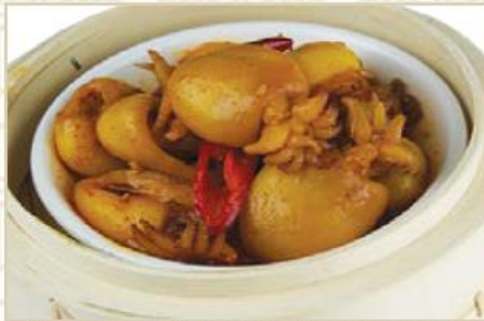
咖哩墨魚仔 Cuttlefish in curry sauce 🌶️ 🥜