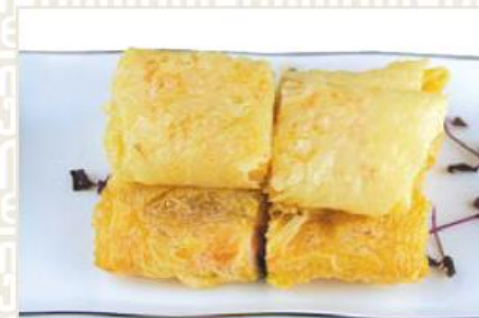
鮮蝦腐皮卷 Deep fried beancurd skin with prawn roll