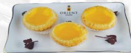
酥皮蛋撻仔 Mini egg tart