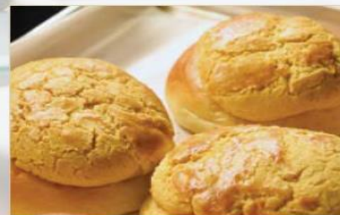
酥皮菠蘿飽 Crispy pineapple bun

圖片只作參考 Images are for reference only • 🌶️ Hot & Spicy 🥜 Contain Nuts 🌱 Suitable for vegetarian • * Denotes option