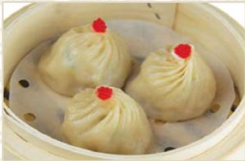
魚子小籠飽 Shanghai pork dumplings