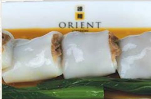
牛肉腸粉 Beef cheung fun