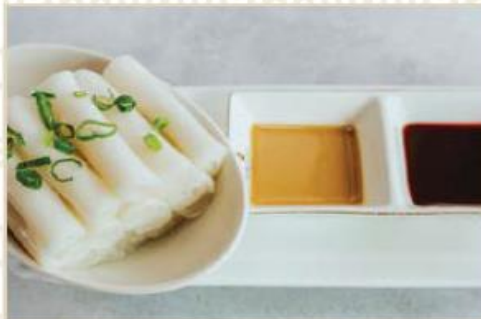
麻醬砵仔腸粉 Plain cheung fun with sesame sauce