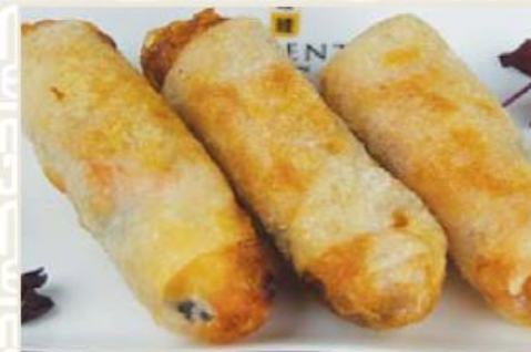
越式炸春卷 Vietnamese spring rolls