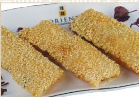
芝麻炸蝦卷 Sesame prawn rolls