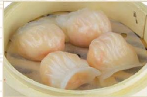
晶瑩鮮蝦餃 Crystal prawn & pork dumplings (har gau)