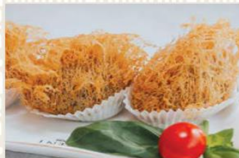
荔蓉炸芋角 Taro croquette with pork