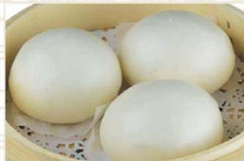
香滑奶皇飽 Custard buns