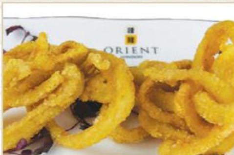
酥炸魷魚圈 Deep fried squid ring