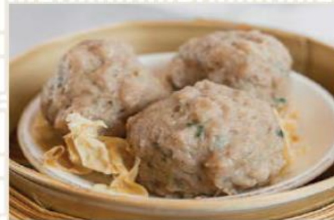
山竹牛肉球 Beef dumplings (contains pork)