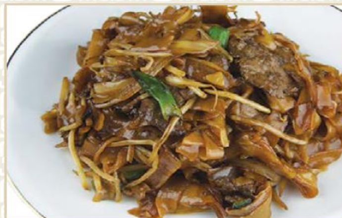
乾炒牛柳河 Teppan fried ho fun with beef fillet (dry)