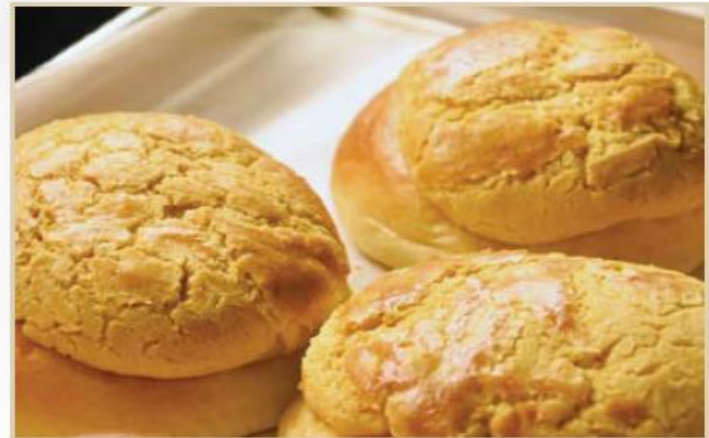
酥皮菠蘿飽 Crispy pineapple bun