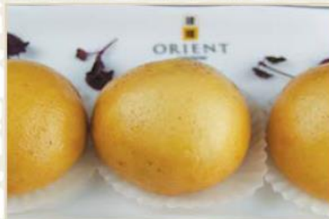
酥炸奶皇飽 Deep fried custard buns