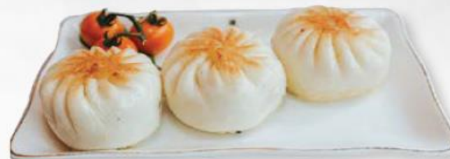
葡式煎飽仔 Portuguese buns (chicken & pork)