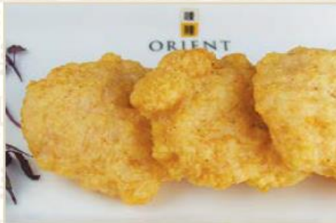
泰式墨魚餅 Thai style squid cakes