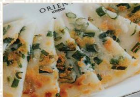
蔥花煎薄餅 Pan fried spring onion pancake