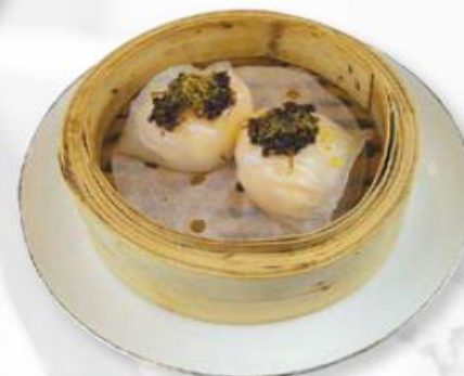
黑松露蝦餃 Crystal king prawn dumplings with black truffle & X.O chilli sauce (contains pork)