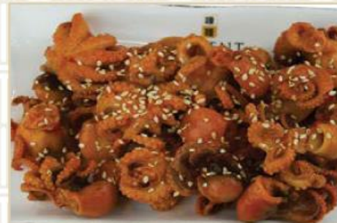
香辣八爪魚 Marinated spicy baby octopus

圖片只作參考 Images are for reference only • Hot & Spicy Contain Nuts Suitable for vegetarian • * Denotes option