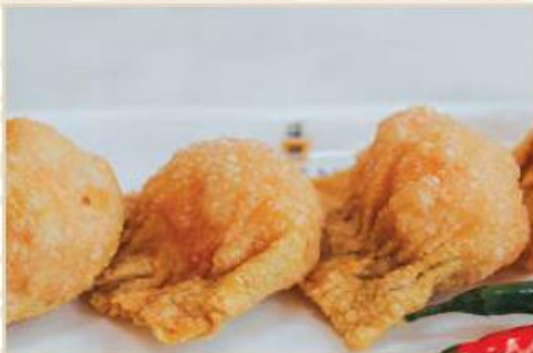
沙律明蝦角 Deep fried prawn dumplings with salad cream