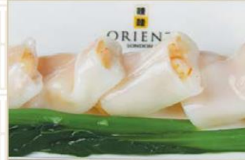
鮮蝦腸粉 King prawn cheung fun