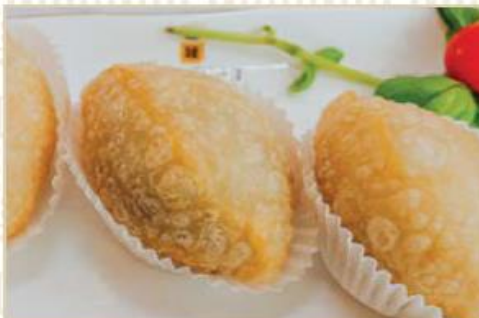
脆皮咸水角 Crispy pastry savoury meat croquette