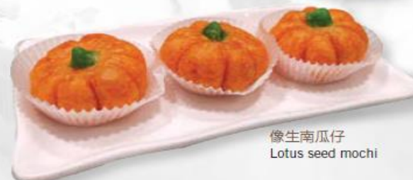
像生南瓜仔 Lotus seed mochi