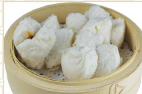
燒皇叉燒飽 Roast pork buns (char siu bun) 🥜

圖片只作參考 Images are for reference only • 🌶️ Hot & Spicy 🥜 Contain Nuts 🌱 Suitable for vegetarian • * Denotes option