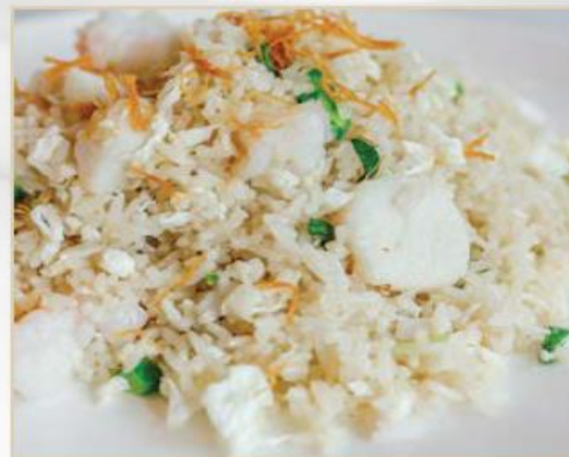
西施太子炒飯 Prince fried rice