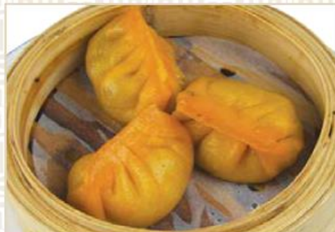
野菇蒸粉果 Mixed wild mushrooms dumplings