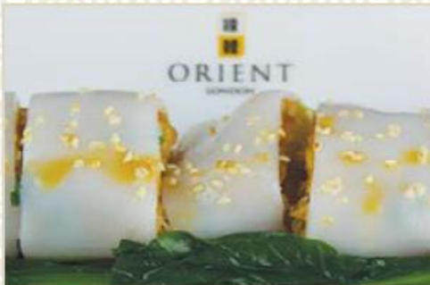
蔥花炸兩 Spring onion & deep fried dough cheung fun