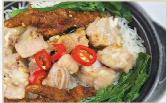
鳳爪排骨飯 Spare ribs & chicken claws 🌶️ 🥜