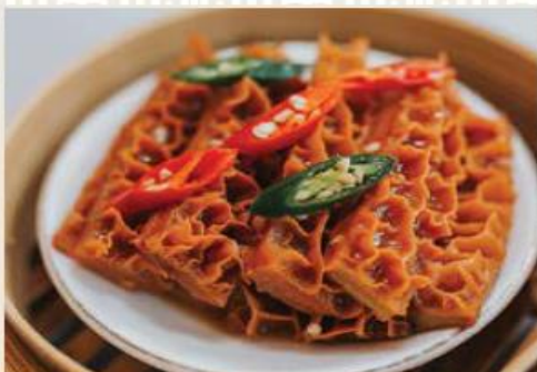
黑椒金錢肚 Beef honeycomb tripe in black pepper sauce 🌶️