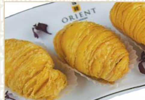
蘿蔔干絲酥 Turnip puff pastry