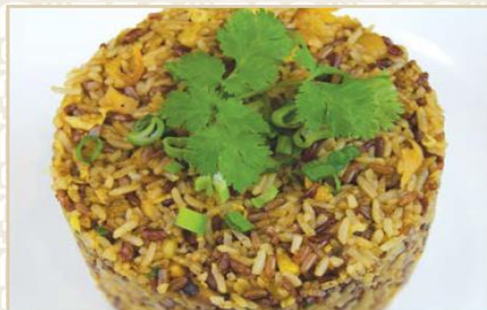
五穀炒飯 Chef's special rice